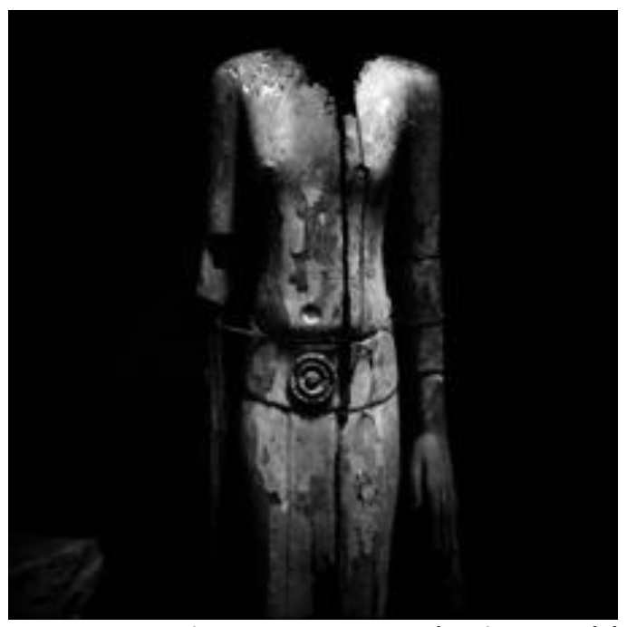
Piyatat Hemmatat, Vestige-No. 01 , 2008, Lamda print on Kodak paper.

Emerging artist Piyatat Hemmatat debates the meaning of faith and Buddhism in current society through personal observation. In his photographic series Vestige (2007), the artist takes a step further into religion and faith by wondering about objects that once existed, represented in the photographic essay by images of mutilated Buddha statues. The shots were taken at various locations in Thailand, once places of worship and today transformed into tourist destinations. In the photographs, the Buddha sculptures stand proud of their holiness despite being mutilated, a memento for a degrading Thai culture that has become ever so distant from a true religious vision. Recalling Manit Sriwanichpoom's black-and-white photographic series Masters (2011), Piyatat's focus goes to the past, to images that were once places of worship and now bearing only the aesthetic, if distant, value of relicts.