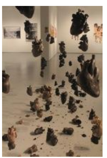
Ruangsak Anuwatwimon, Ash Heart Project, 2007, ashes from various sources, dimensions variable.