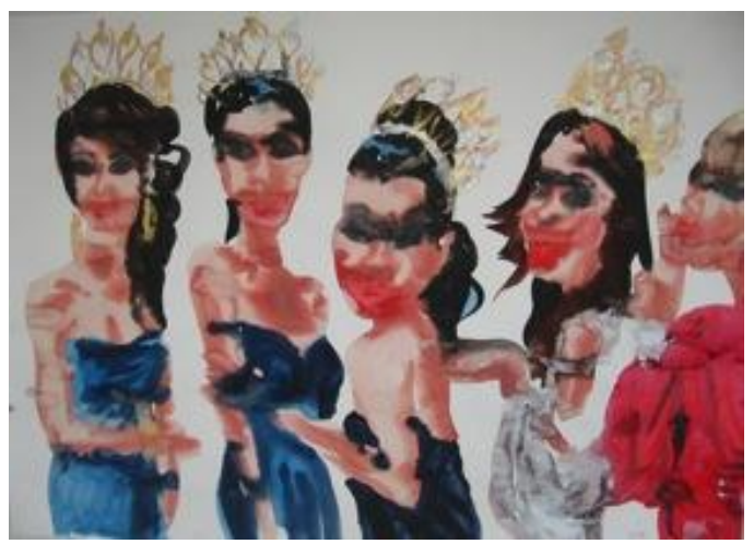
Tawan Wattuya, Lady Boys , 2009, watercolour on paper, 70 \times 100 cm.

The unstaged images of gritty everyday life are the focus of Tawan Wattuya's figurative works. The impressionistic quality of his watercolours, which depict the busy and complex life in the Thai capital, caught between the licit and illicit, carries with it a sense of simplification and humour, making his style unique in the Thai contemporary art scene. Tawan often derives images from magazine clippings, bars in the red-light district and various gatherings of people proudly parading their social uniforms; these are the emblems of Thai society that Tawan wants the audience to be aware of. In the chaotic and apparently unregulated life in the capital, most people opt for rules and compliance in order to accommodate a society that is still strongly critical of non-conformism.