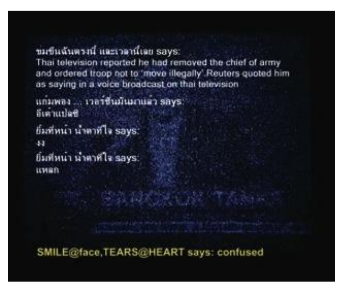
Nawapol Thamrongrattanarit, Bangkok Tank , 2006, video still.

Taiki Saenjaroen's short video A Ripe Volcano (2011) is also inspired by the power of the masses within the Thai political landscape and shot, among other locations, at Rattanakosin Hotel (the Royal Hotel near the Grand Palace), where civilians were captured and tortured during Black May 1992. Bangkok Tank (2006) by film director Nawapol Thamrongrattanarit is a short, provocative videocollage in which the artist offers a humouristic, if crude, documentary of the night in September 2006 when Premier Taksin Shinawatra was ousted. Surreal online chatting is over imposed to pixelated images of the broadcasted coup d'etat while an equally surreal, cheerful music accompanies the idiosyncratic reality.